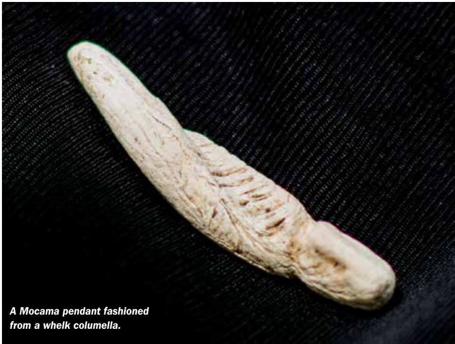
A Mocama pendant fashioned from a whelk columella.

The structure is located near the wall trench he discovered in the late '90s. The field school ended before the researchers could finish excavating the structure, but Ashley intends to return to the site next season.