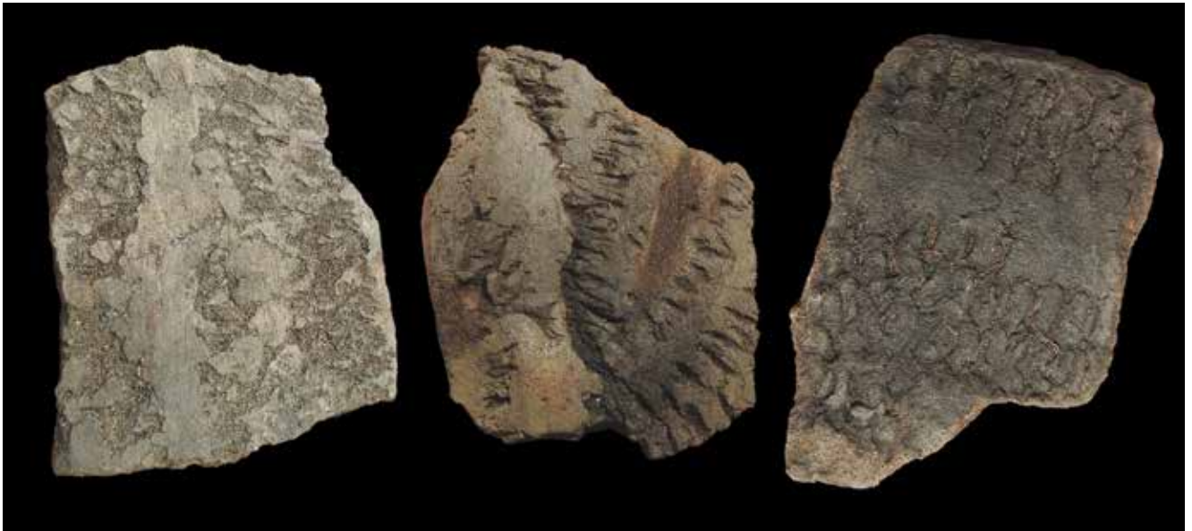
Prior to 1600, the Mocama favored San Pedro pottery, three examples of which are seen here.

culture and burial practices of Grand Shell Ring, these sites resemble settlements found in southeast Georgia that were also occupied after 1250. This leads Ashley to surmise that small groups of people, possibly from Georgia, were moving around Big Talbot, and they could have established Sarabay.