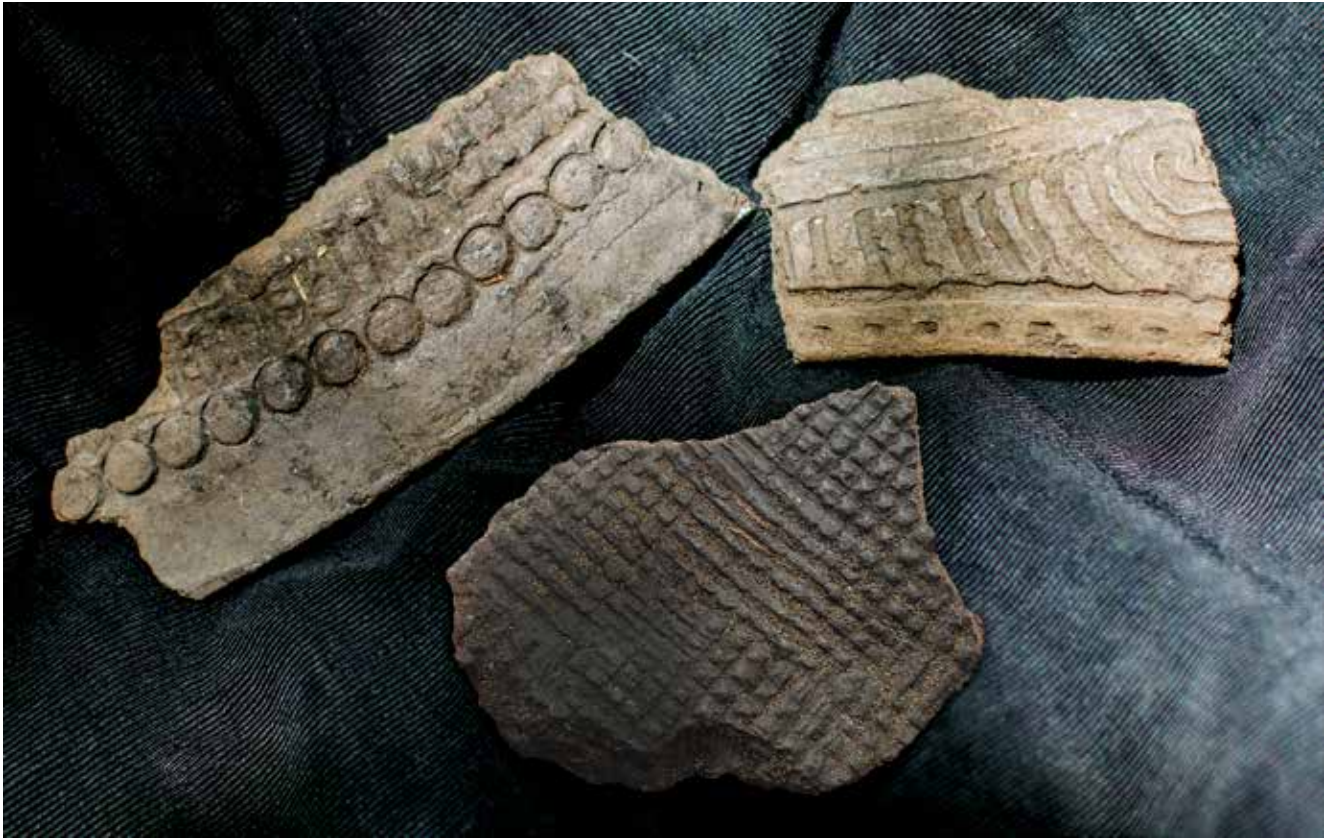
These sherds are examples of San Marcos pottery, which the Mocama began producing around 1600.