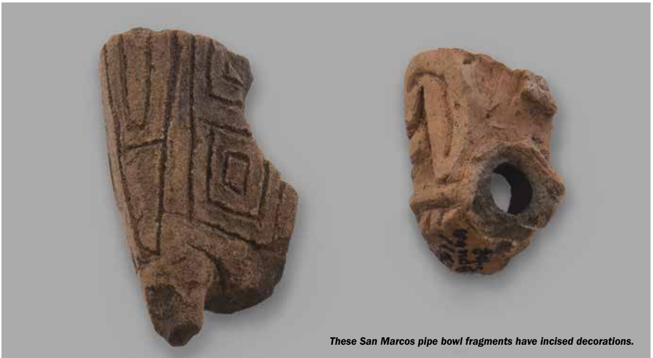
These San Marcos pipe bowl fragments have incised decorations.